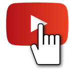
Smart Socket video