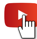
DB-RAD PLUS video

Digital B-RAD series torque wrenches are the world's first digital, cordless and lithium-ion battery tool on the market. With advanced technology containing digital display and single increment torque settings.